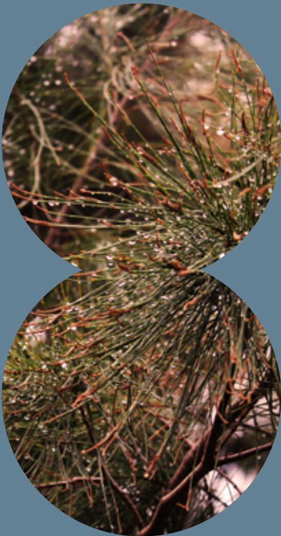
Lot 4 — 64 May Road