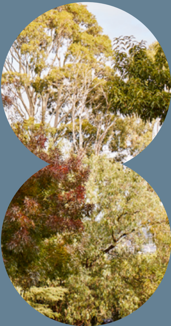
Lot 32 — 64 May Road