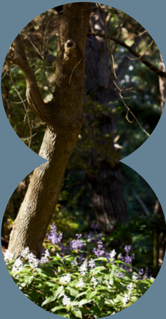
Lot 49 — 64 May Road