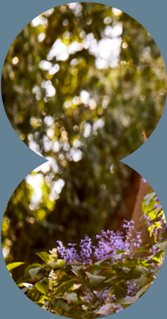
Lot 5 — 64 May Road